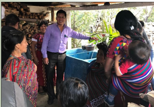
Clean water flowing to a village

It is critical that we have strong and trusting relationships with the Rotarians in Guatemala—relationships that are best