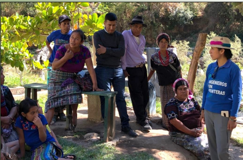
Community meets to discuss needs.

The trips foster opportunities to build and celebrate essential relationships with Guatemalan Rotarians and